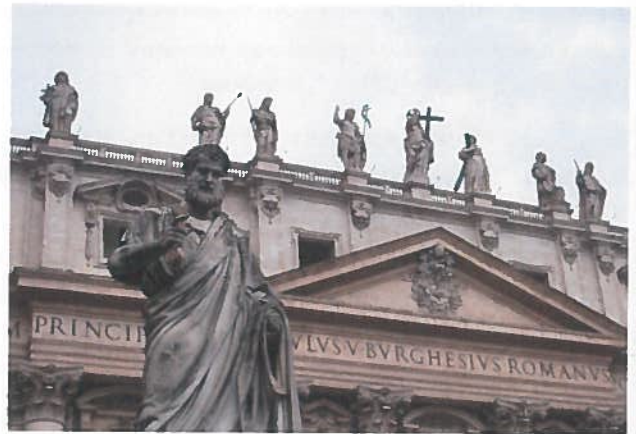
To find the job description of a modern pope, look no further than Peter's example

In Acts, Peter has a vision that reveals to him that Gentiles as well as Jews will be welcomed into the church. In the letters attributed to him, Peter is perceived as an elder among elders, as well as one capable of amending errant teachings. Yet Peter's also represented in Acts as a team player, working in full partnership with John and willing to accept the discernment of James when in Jerusalem. Peter's not just the boss left in charge after Jesus returns to his Father. After an early career of impulsive speech and rash behavior, Peter's been humbled, becoming a leader who appreciates that the wisest way to wield authority is to seek good counsel and faithful collaborators all along the path.