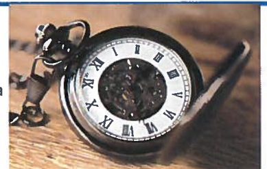
This sanctification of time acknowledges that time is a divine aspect of creation just as space (i.e. the world) is.

Scripture: Matt. 5:44; 6:9-13; Luke 11:1-13; 18:1-8; Acts 2:42; 3:1; 20:36; 21:5-6; 1 Thess. 5:16-18; Eph. 6:18