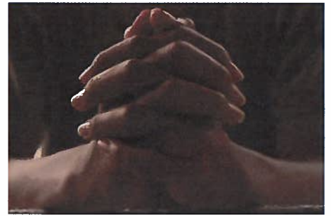
Tertiaries get the nod of approval precisely because of their deep connection to long-established communities with full canonical oversight.

Today, tertiaries are divided into two categories: secular third orders and regular members. Seculars are like my sister, who lives a relatively normal life while participating in the prayer life and values of her chosen affiliation. She wears a scapular to remind her of her promises, and when she dies, she may choose to be buried in the habit worn by her group. Regular third order members take simple vows as well as following the rule of their community. If a religious community feels resonant for you, inquire about the possibility of associate status.