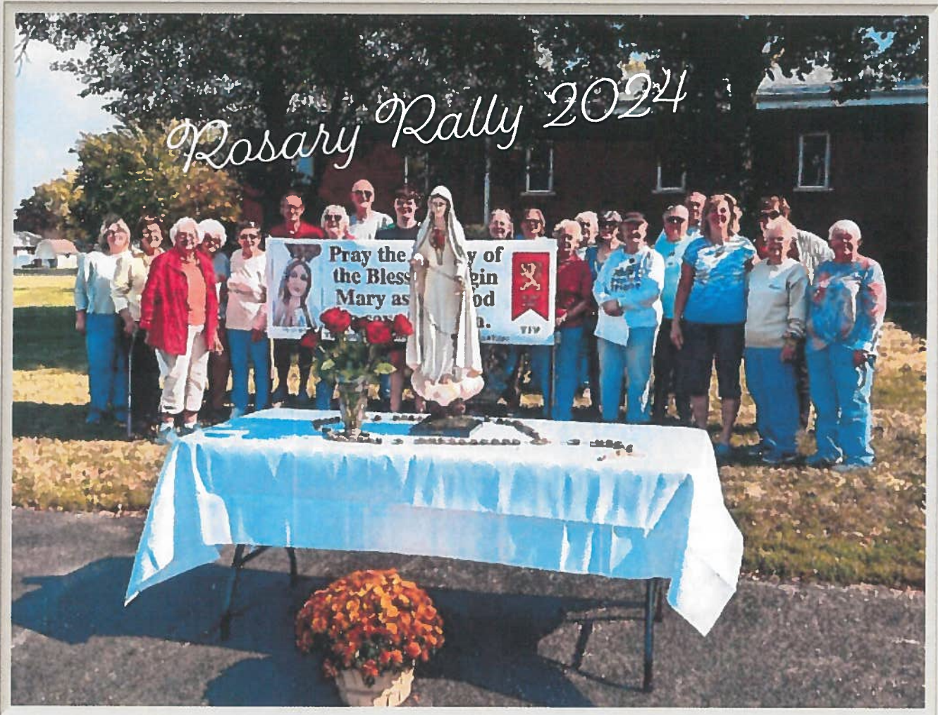
Parishioners from all three parishes participated in the Oct. 12th Rosary Rally held at St. Margaret Mary .