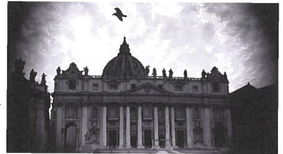
Only two are known as Vatican Councils because the rest were held elsewhere than the Vatican Basilica in Rome.

Please pray for the students who received the Sacrament of Reconciliation at St. James on Saturday, March 8.