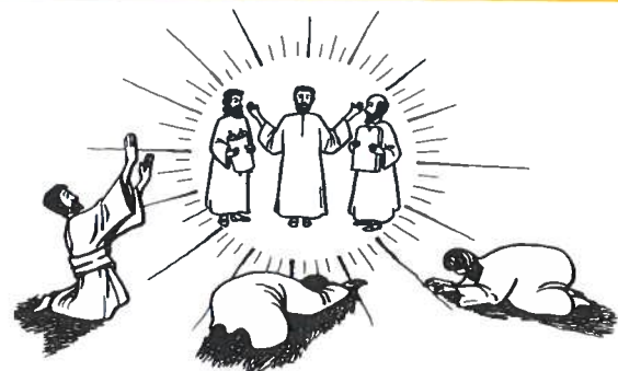
He was transfigured before them...